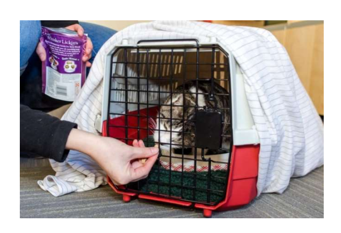
3. Practice closing the door.