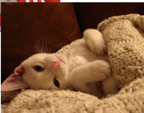
Foster kitten Amos

If you are interested in joining the Foster Volunteer Team at AHS, contact the program coordinator at fostercare@austinhumanesociety.org or at 512-685-0112