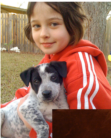
Foster puppy Brisket

Foster families provide housing, food, bedding and toys for the animals in their care. They also provide exercise, socialization and lots of love! The Austin Humane Society provides all medical care for animals in foster homes, including vaccination, medications and spay/neuter surgery.