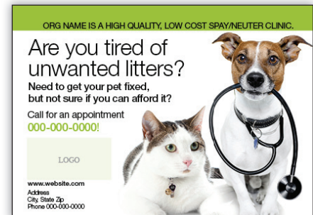
6" x 4.25" 4-Color Ad