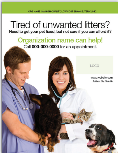
8.5" x 11" 4-Color Flyer