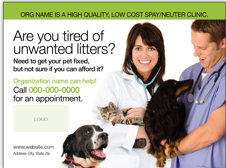
24" x 18" 4-Color Poster