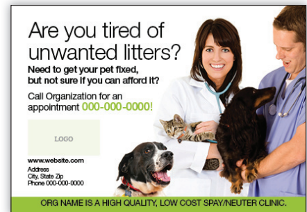
6" x 4.25" 4-Color Ad