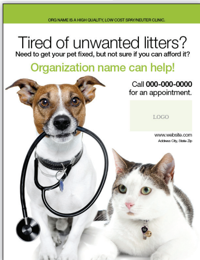
8.5" x 11" 4-Color Flyer