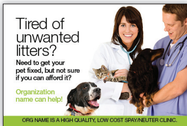
6" x 4" 4-Color Postcard