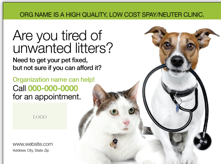
24" x 18" 4-Color Poster