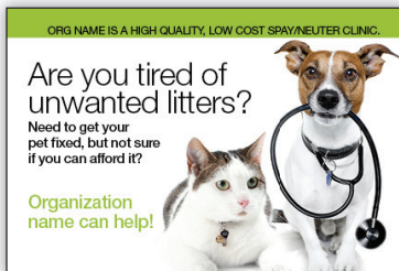
6" x 4" 4-Color Postcard