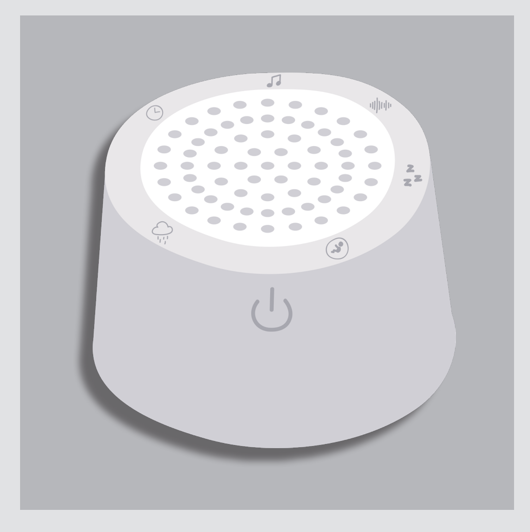
Sound machines mask loudness elsewhere in the clinic