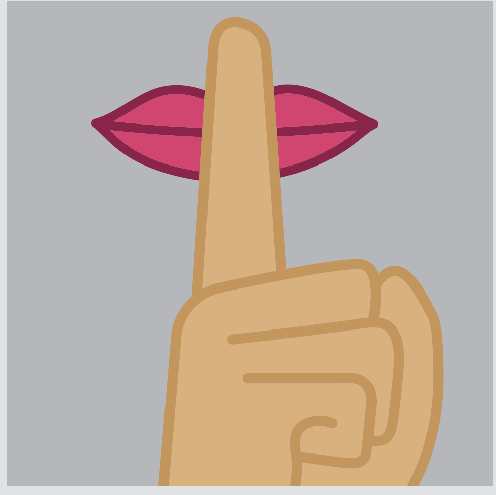
Minimizing noise reduces fear and stress