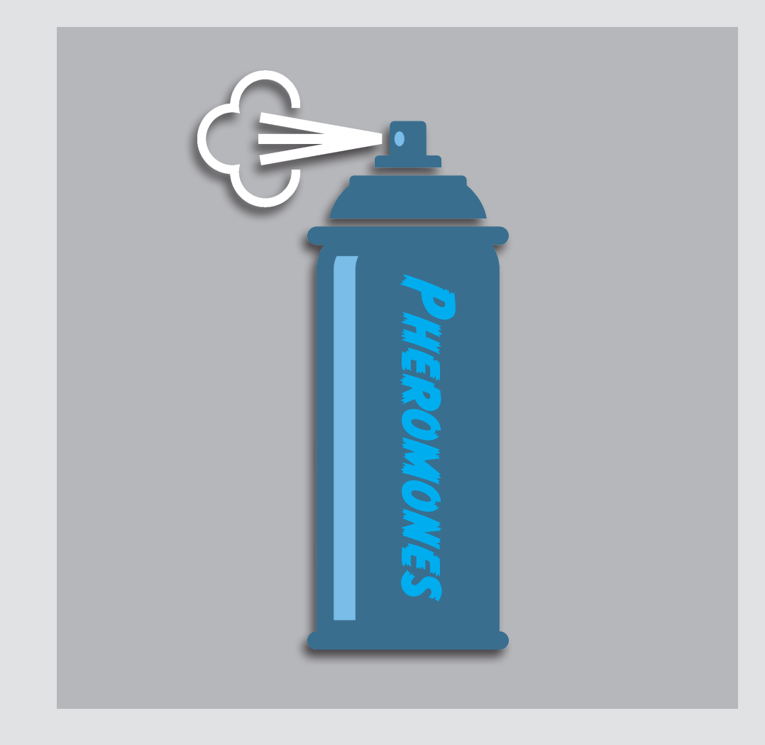
Pheromone sprays help cats feel at home