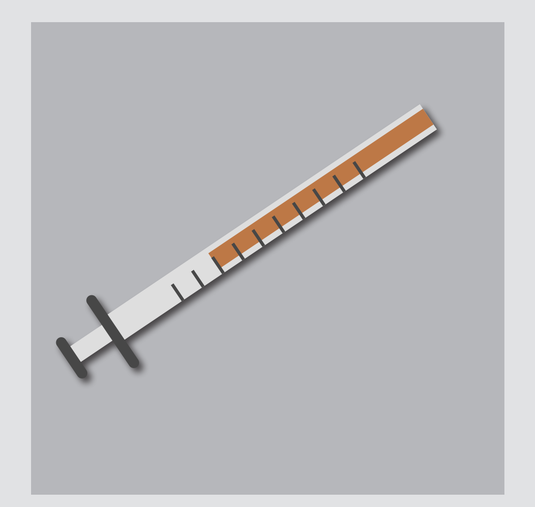
Gabapentin reduces pain and anxiety and increases compliance