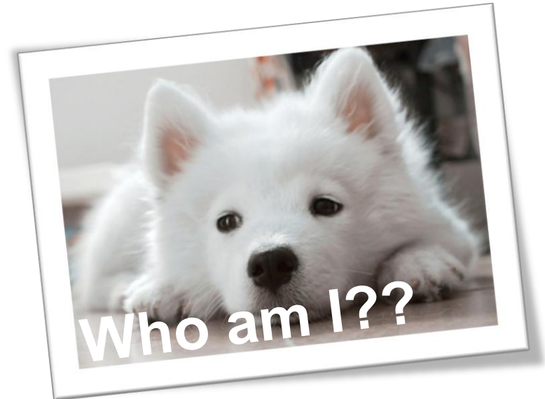
Photo of animal included in records