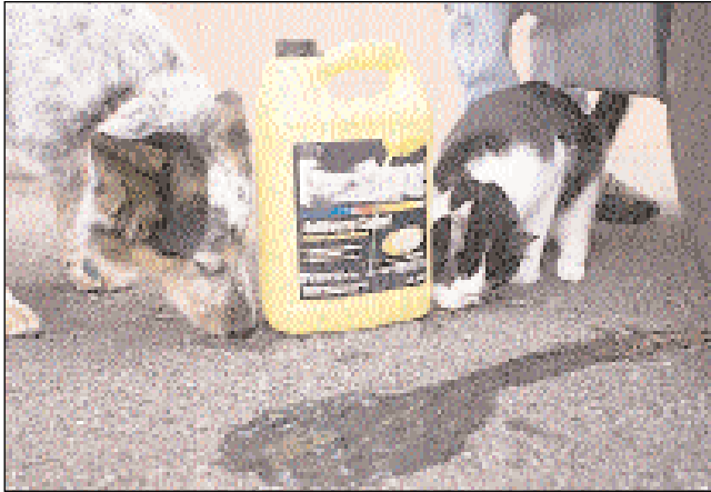
Figure 1 —Antifreeze, which contains ethylene glycol, is extremely dangerous for dogs and cats. Exposure often results from spills or leaks from coolant systems. Animals are attracted to the substance because of its sweet taste.

cal signs. Delaying treatment until there is evidence of renal insult (i.e., increased blood urea nitrogen and creatinine values) will place patients at increased risk, resulting in a poorer prognosis.