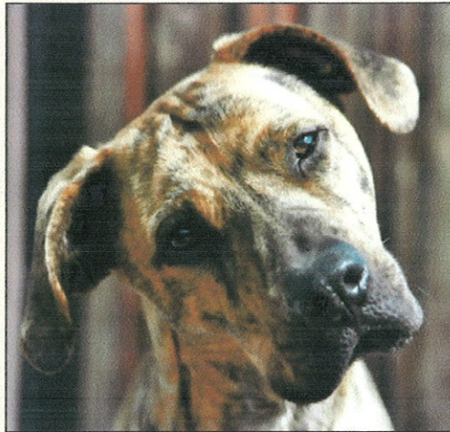
No More Homeless Pets Coalition

The Greater Brandon Chamber of Commerce will hold its annual Spring Job Fair from 10 a.m. to 2 p.m. April 17 at Hillsborough Community