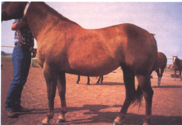
Figure 5. Broodmare in early gestation in Body Condition 6: Moderate to Fleshy. Note fat deposits along sides of withers, behind shoulders, and along the sides of the neck.