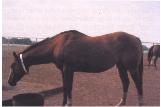
Figure 4. Broodmare in early gestation in Body Condition 5: Moderate. Note shoulders and neck blend smoothly into body. No visual appearance of ribs.