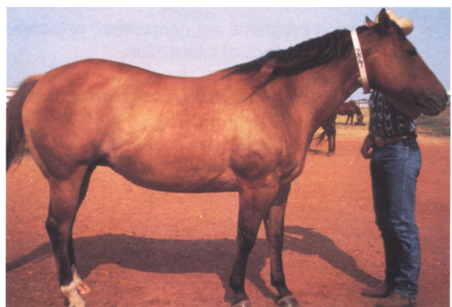
Figure 6. Broodmare in early gestation in Body Condition 7: Fleshy. Note noticeable filling between the ribs, roundness of tailhead, and appearance of fat behind the shoulder.